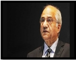
Mr. Justice B. N. Srikrishna

Justice B. N. Srikrishna is a former judge of the Supreme Court of India. He is currently the chairman of Financial Sector Legislative Reforms Commission (FSLRC). He has headed various commissions such as the 'Commission of Inquiry' set up to investigate into the Bombay riots of 1992-93, which became known to all as the Srikrishna Commission. He then headed a one man commission to inquire about the Madras High Court riots of 2009. In 2010, he was appointed as the Chairman of a five member committee called the Srikrishna committee that was constituted to look into the demand for separate statehood for Telangana.