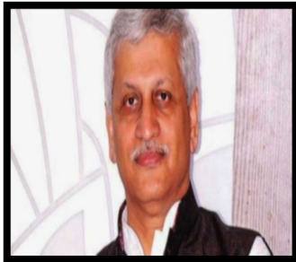
Hon'ble Mr. Justice U U Lalit

Justice B. N. Srikrishna is a former judge of the Supreme Court of India. He is currently the chairman of Financial Sector Legislative Reforms Commission (FSLRC). He has headed various commissions such as the 'Commission of Inquiry' set up to investigate into the Bombay riots of 1992-93, which became known to all as the Srikrishna Commission. He then headed a one man commission to inquire about the Madras High Court riots of 2009. In 2010, he was appointed as the Chairman of a five member committee called the Srikrishna committee that was constituted to look into the demand for separate statehood for Telangana.