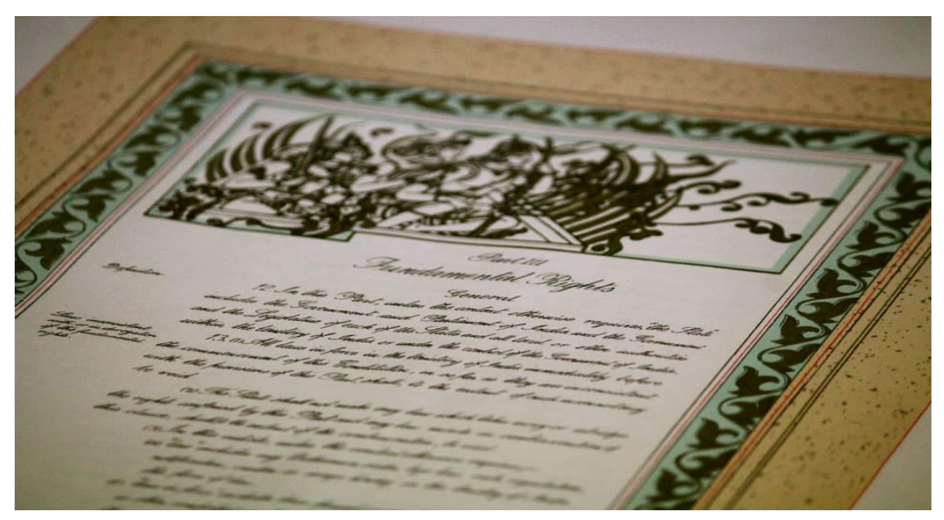
Original Copy of the Constitution of India as illustrated by Nandalal Bose and scripted by Narain Razada.

However good a Constitution may be, if those who are implementing it are not good, it will prove to be bad. However bad a Constitution may be, if those implementing it are good, it will prove to be good.