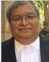
Amit Desai (Senior Advocate at Bombay High Court)