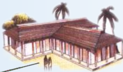
Mess & Recreation Building