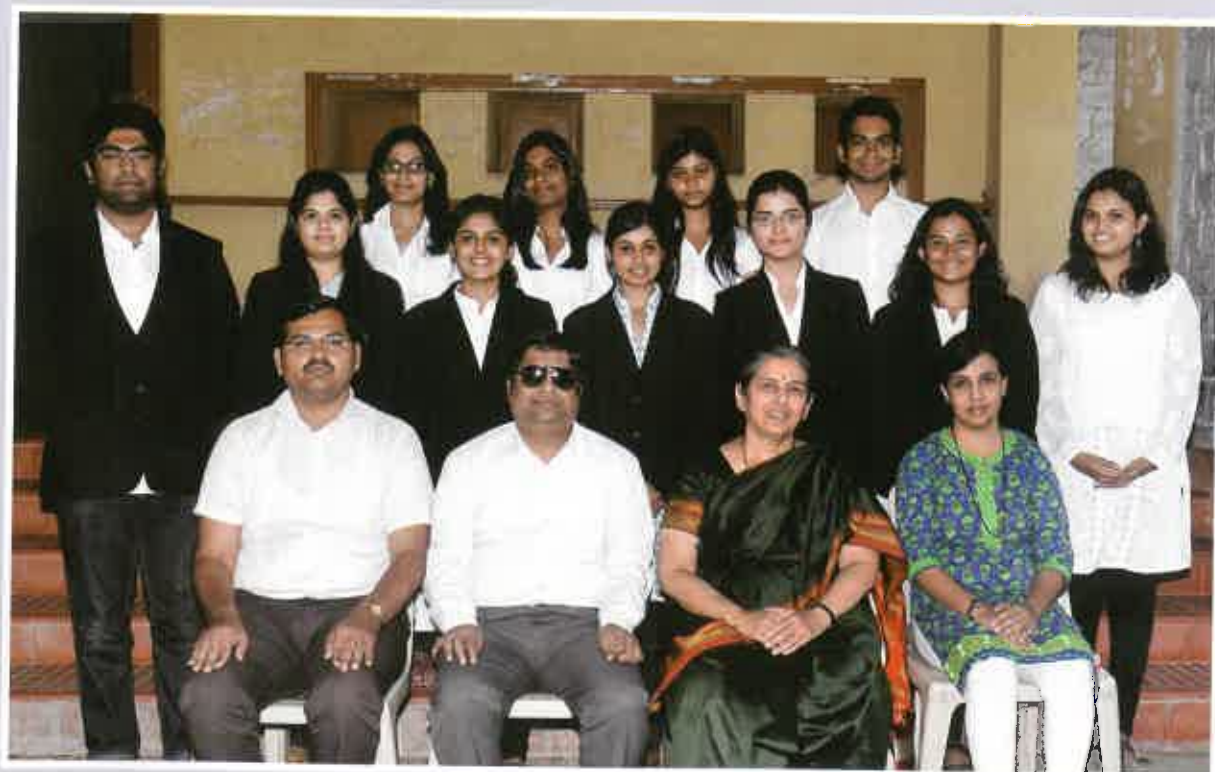
Faculty and Students (National Seminar on 'Political and Judicial Perspective on Electoral Reforms in India')