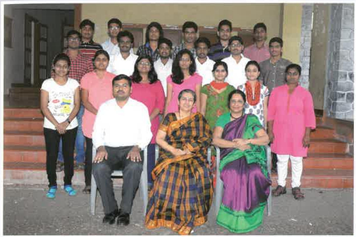
Faculty and Students - Remedial English Lectures