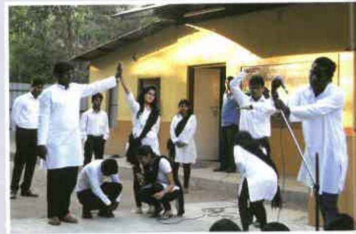
Participation of Students at Legal Aid camp, Shri Saraswati Vidya Mandir Kothrud, Pune on 6 th February 2014