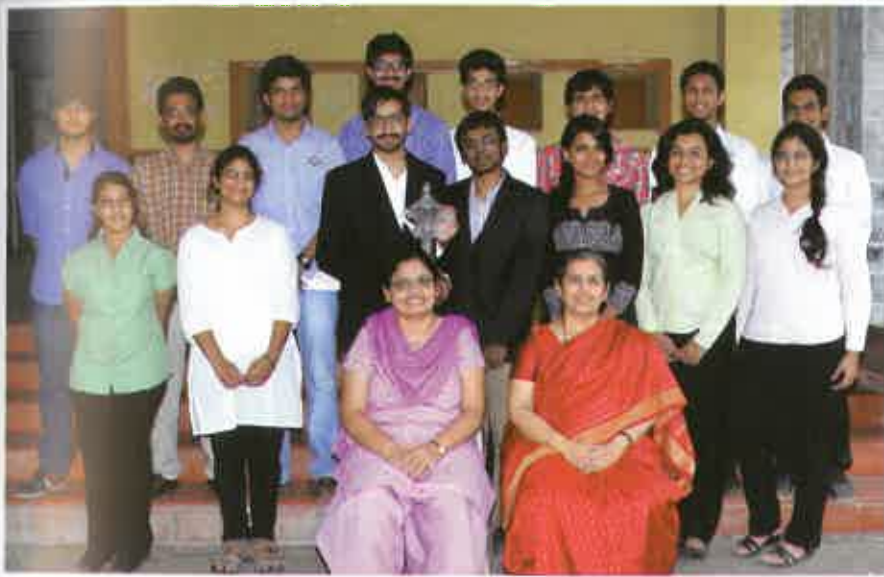
ILS IPR Cell