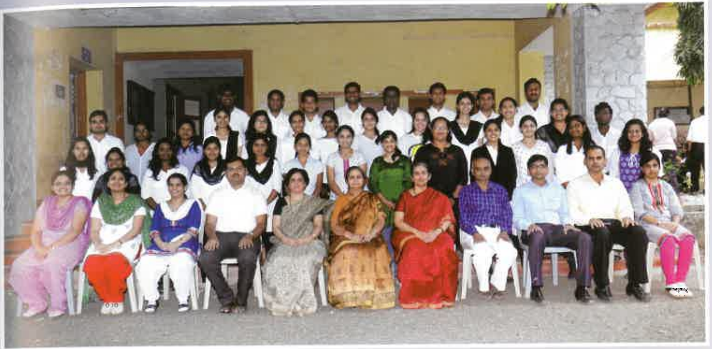
Faculty and Students (Five Year and Three Year Law Course)