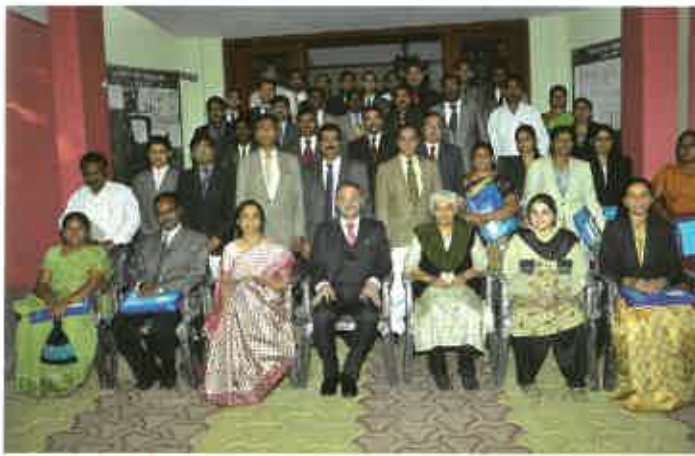
Participants of the Workshop, Beed