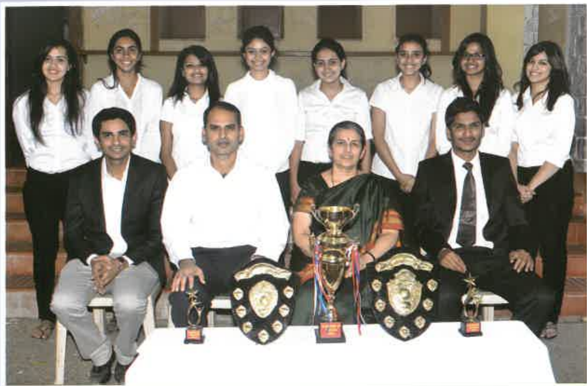
Basket Ball (Girls)