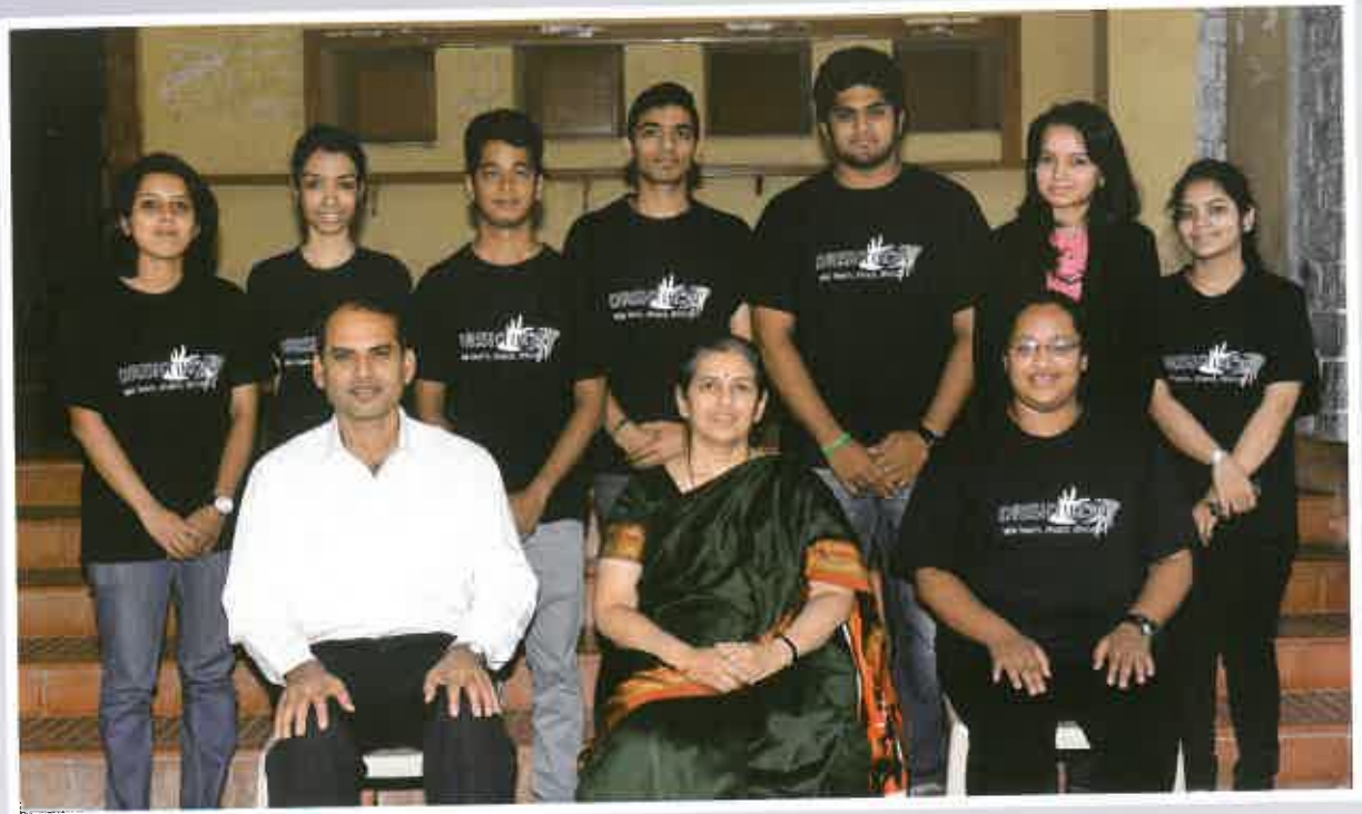
Faculty and Students