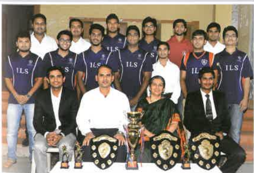
Volley Ball (Boys)