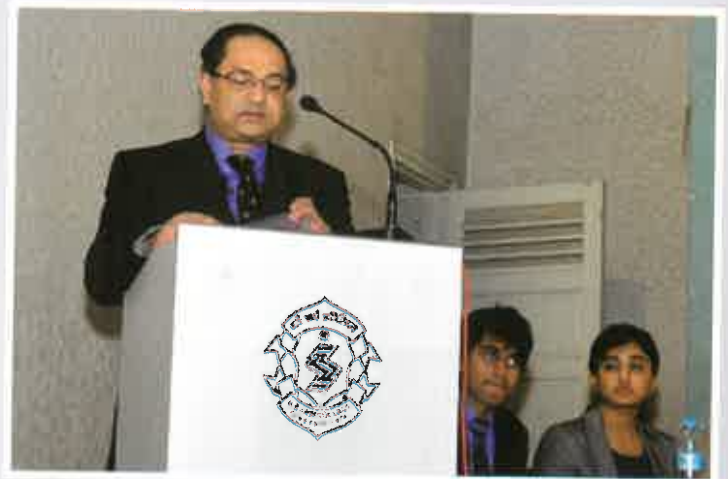
◀ Shri Mohan Parasaran, Solicitor General of India addressing the audience of Conference