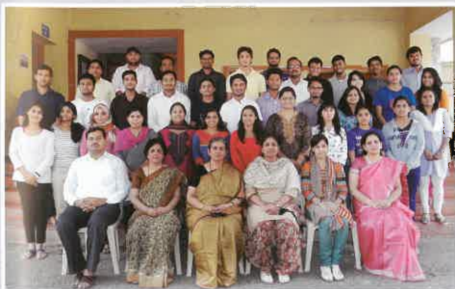
Diploma in Medical Jurisprudence and Forensic Science