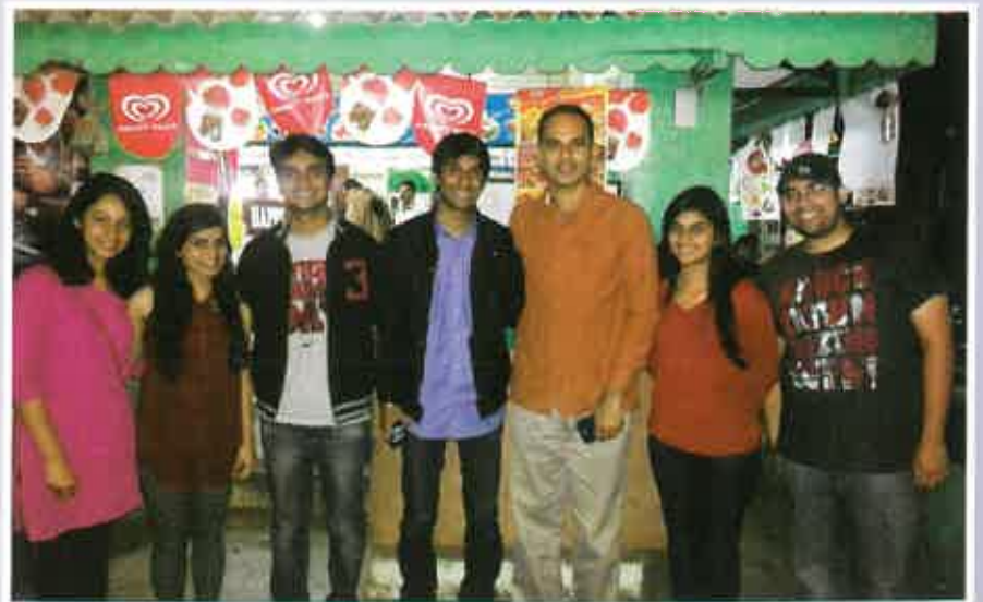
Aahwaan (Hindi and English Drama)