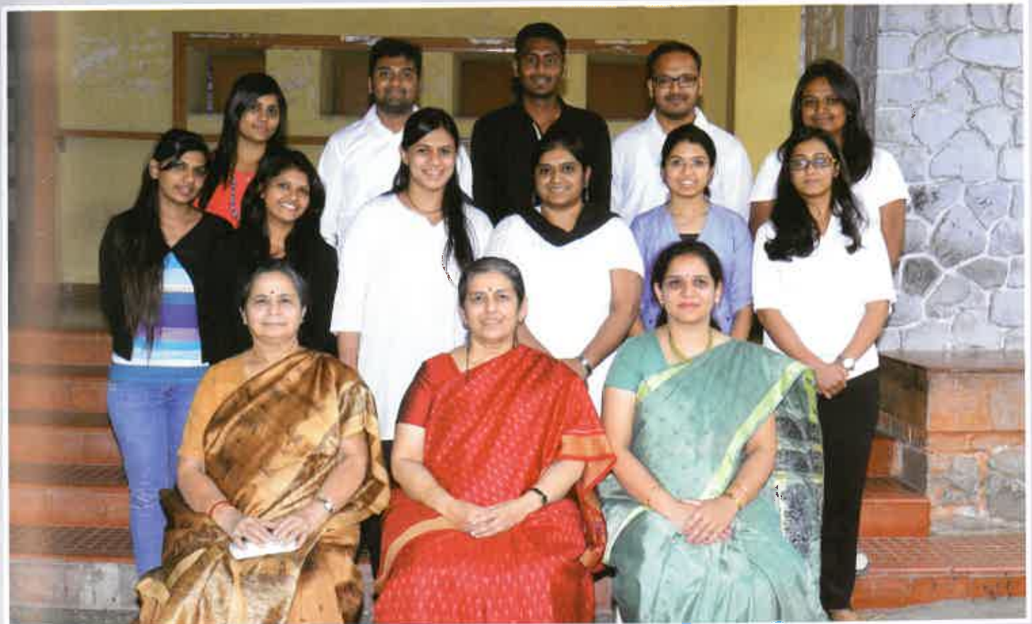
Faculty and Students (LL.M)