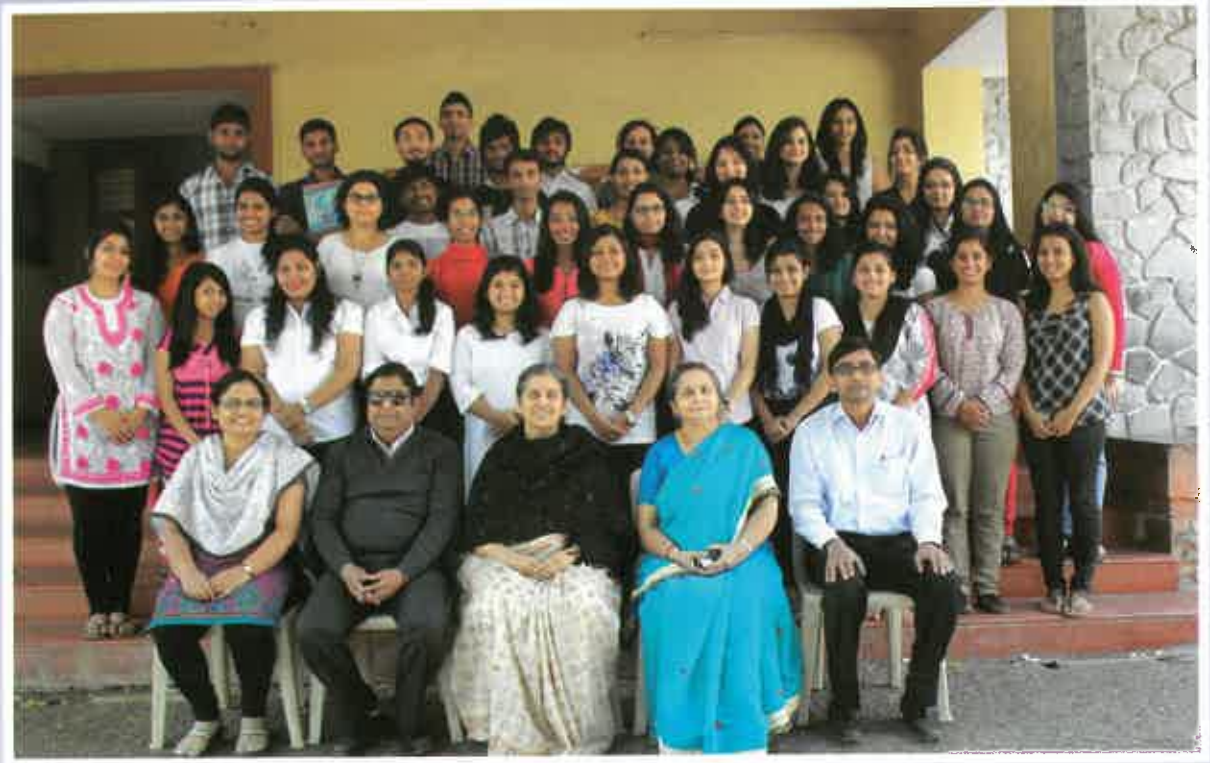
Diploma in Human Rights