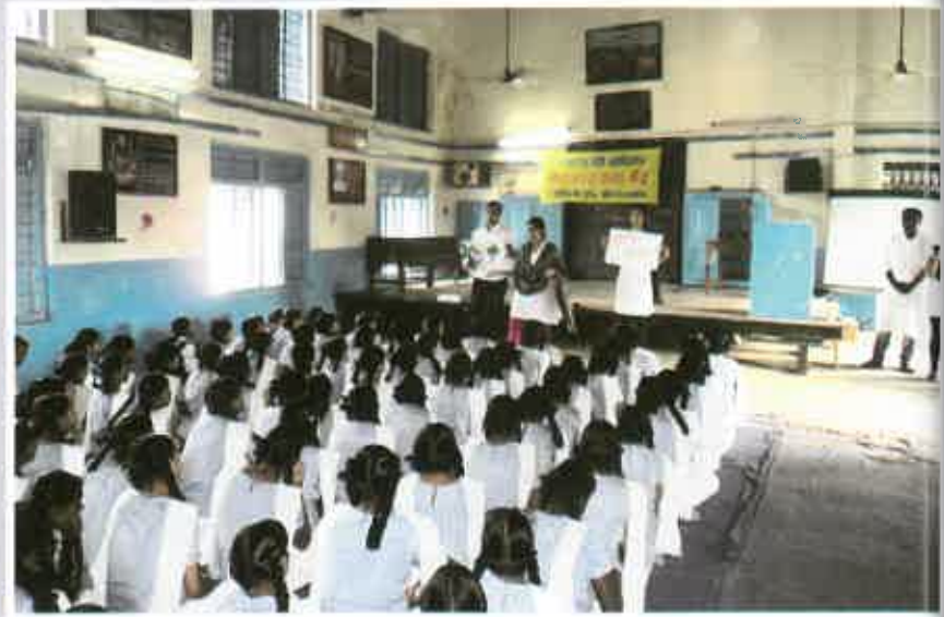
Participation of Students at Legal Aid Camp, Baburao Sanas Vidaylaya, Mangalwar Peth, Pune on 19 th August 2013