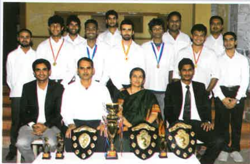
Badminton and Athletics (Boys)