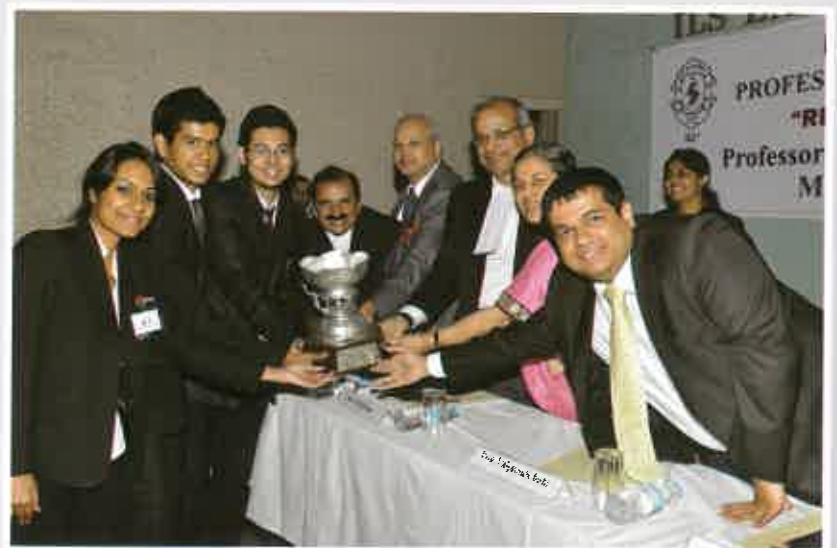
Winning Team School of Christ Law University, Bangalore