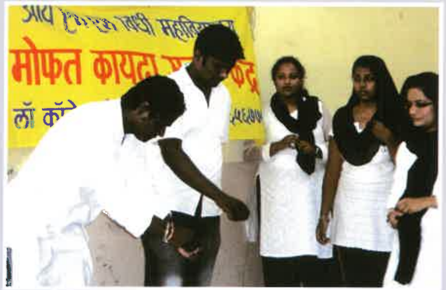
Participation of Students at Nav Bharat High School, Shivane, Pune on 15 th January 2014