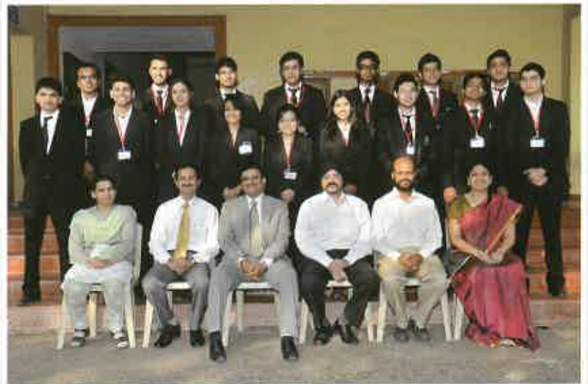
Judges of Semi Final Round with participants