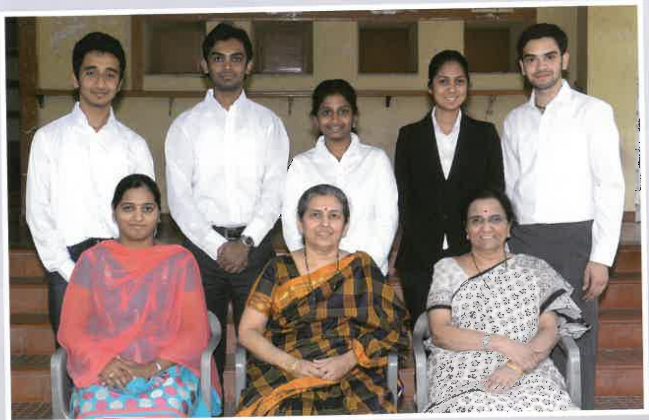
ILS Placement Cell