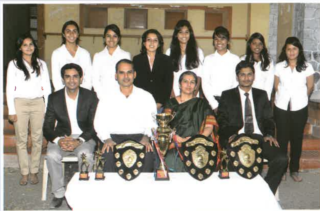
Foot Ball (Girls)