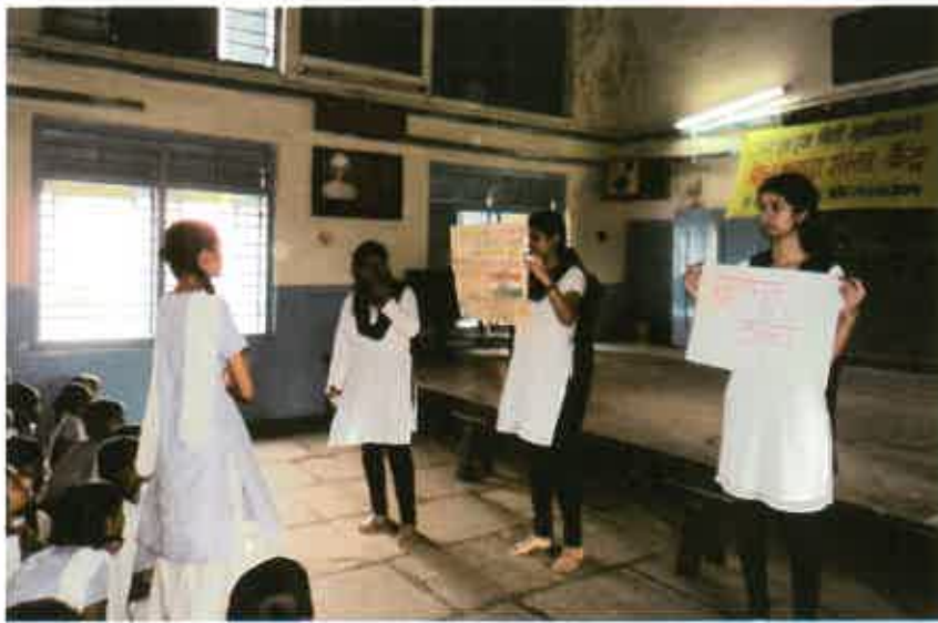
Participation of Students at Legal Aid Camp, Baburao Sanas Vidaylaya, Mangalwar Peth, Pune on 19 th August 2013