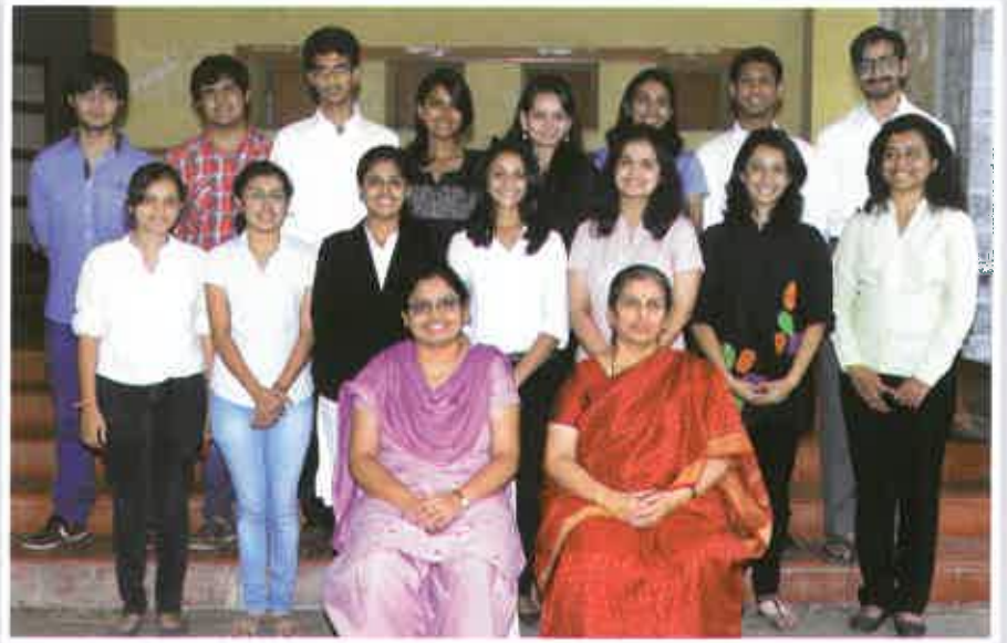
ILS Quiz Club