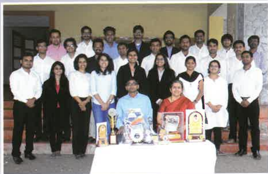
ILS Debate Society