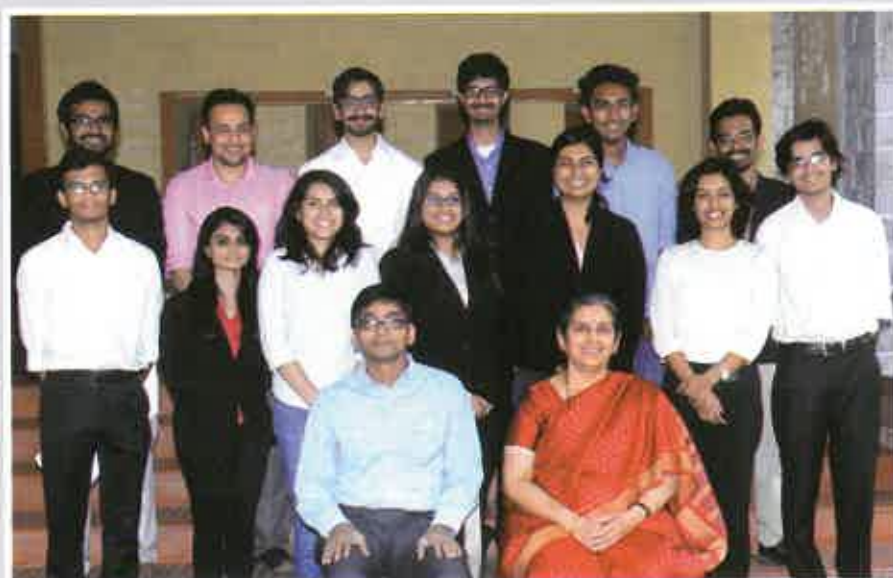
Debate Society (English)