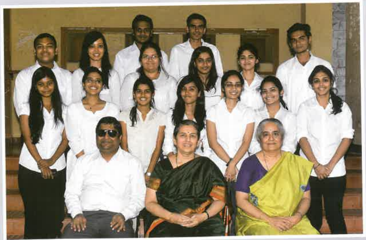
Faculty and Students