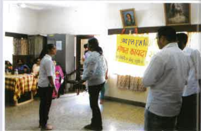
Participation of Student at Legal Aid Camp in Deepgriha Society, Tadiwala Road, Pune on 31 st August 2013