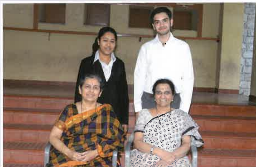
Diploma in Corporate Laws (Volunteers)