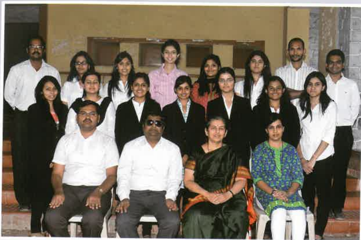
Faculty and Students (Research Projects)