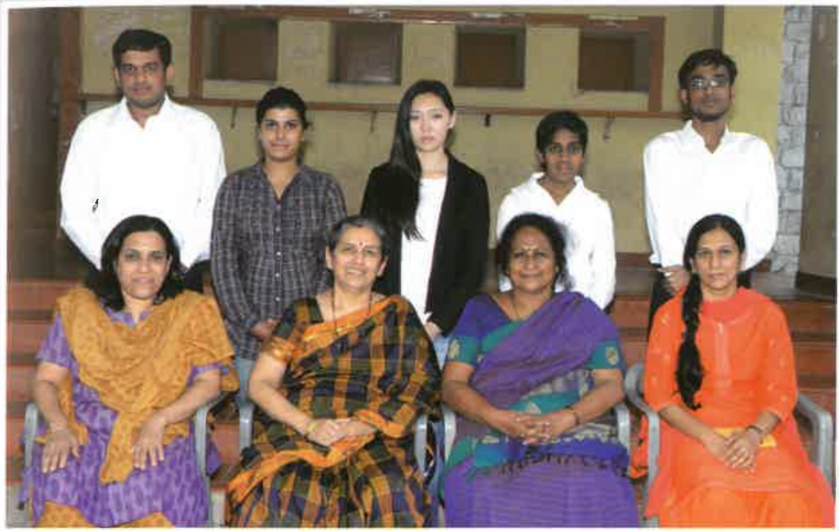
Diploma in Alternate Dispute Resolution