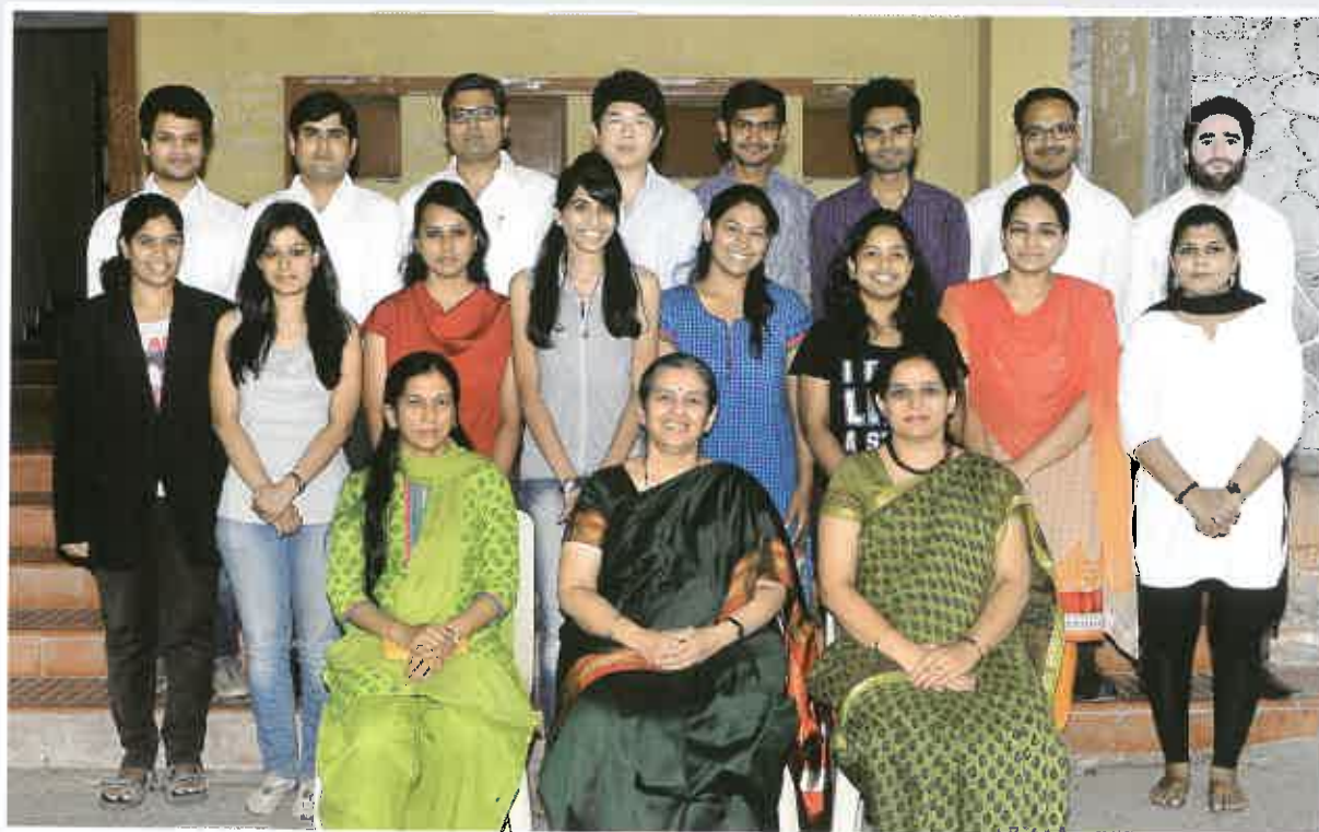
LL.M Second Year Students and Faculty