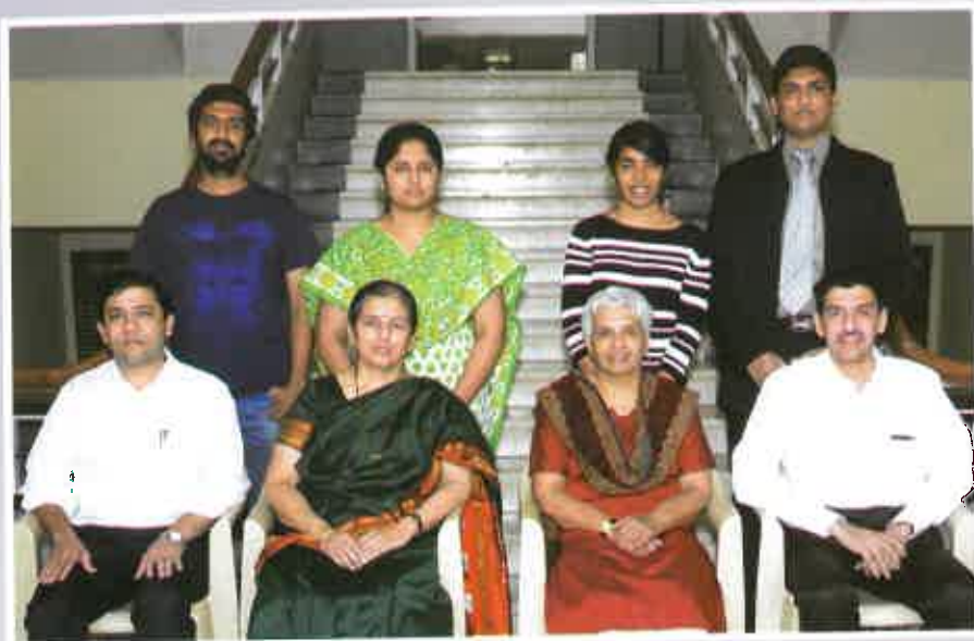
Faculty and Students