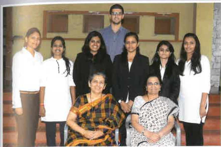
Diploma in Corporate Laws