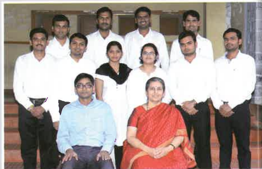
Debate Society (Marathi)