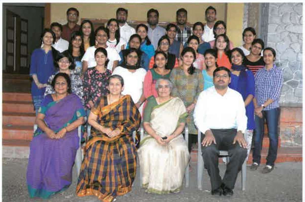
Faculty and Students Nine Day's Lecture Series on - 'Dimensions of Gender Justice and Equality'