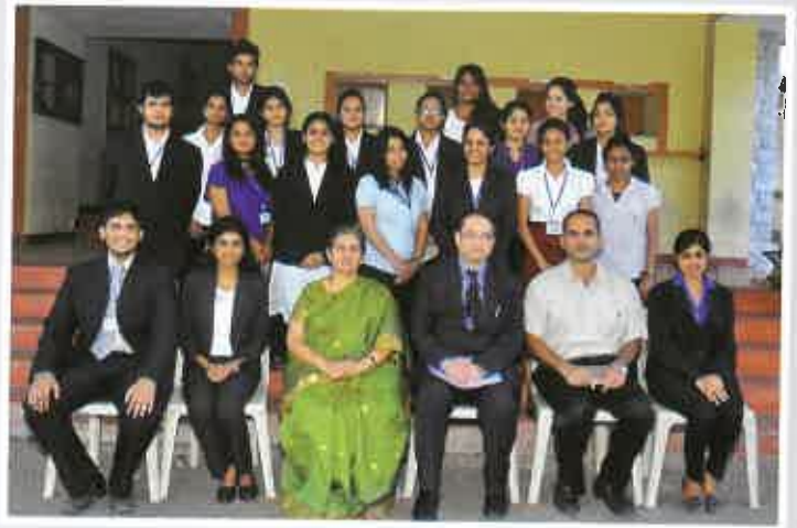
Shri Mohan Parasaran, Solicitor General of India, alongwith Faculty and Co-ordinators