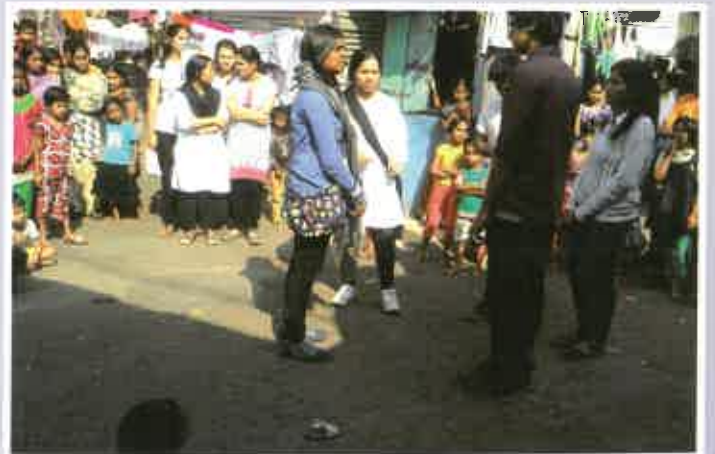
Participation of Students at Legal Aid Camp, Deepgriha Society, Ambedkar Nagar, Market Yard, Pune on 27 th January 2014