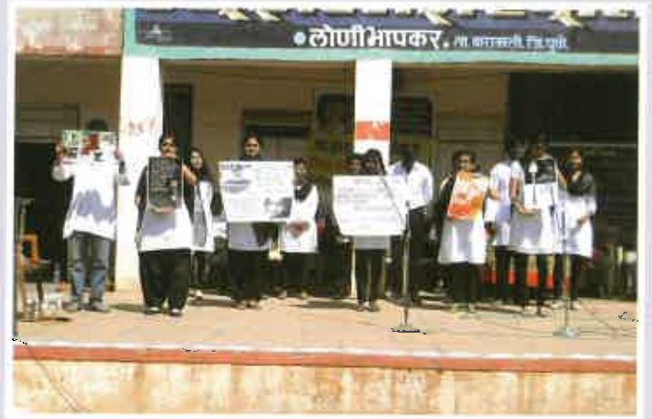
Participation of Students at Legal Aid Camp, Loni-Bhapkar village on 14 th February 2014