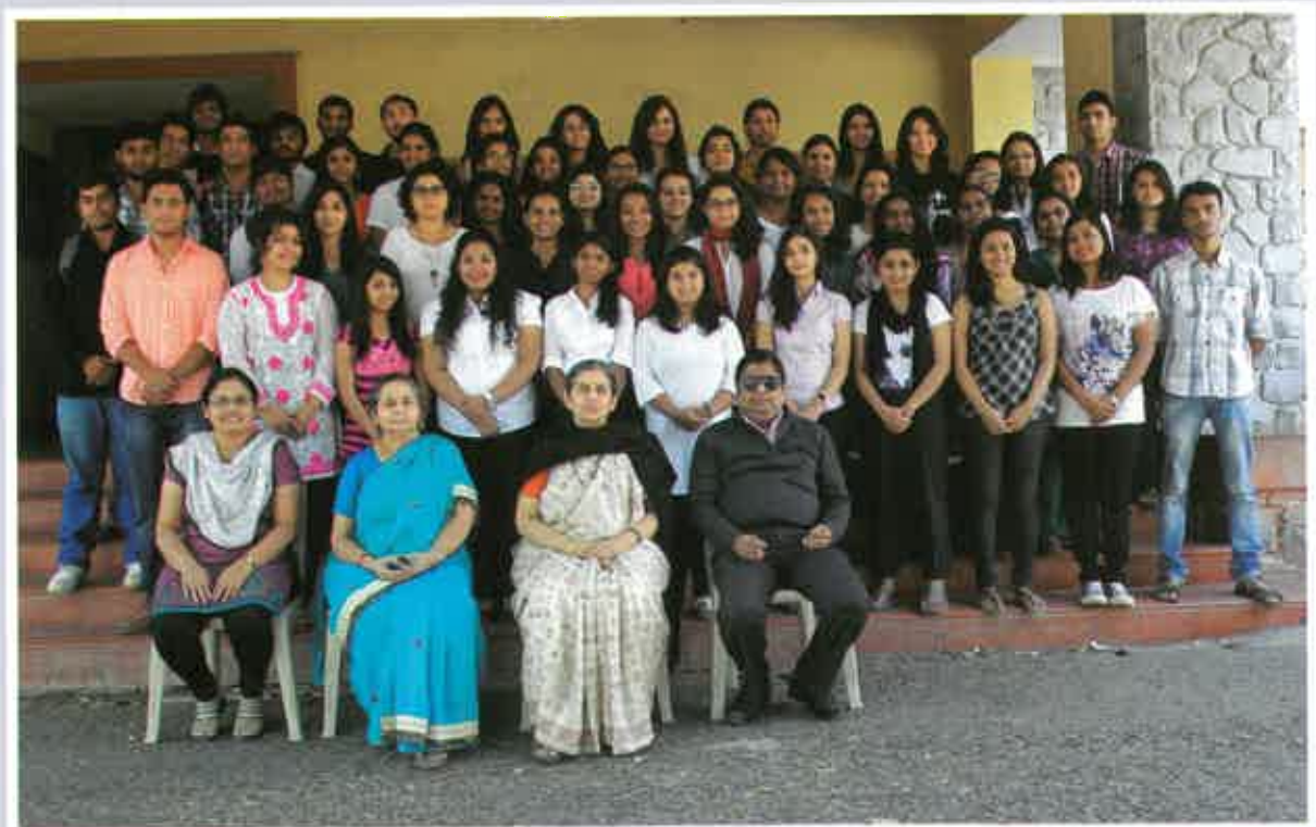
Diploma in Human Rights