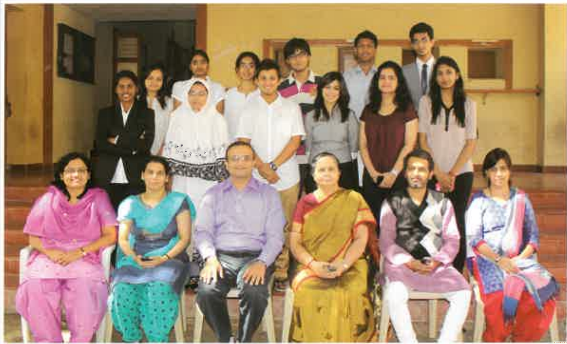
Resource Persons, Faculty Members, Student Presenters and Student Co-ordinators