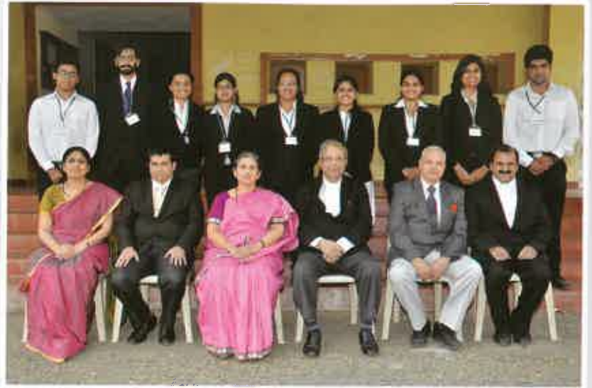
Judges of Final Round with Faculty and Student Co-ordinators