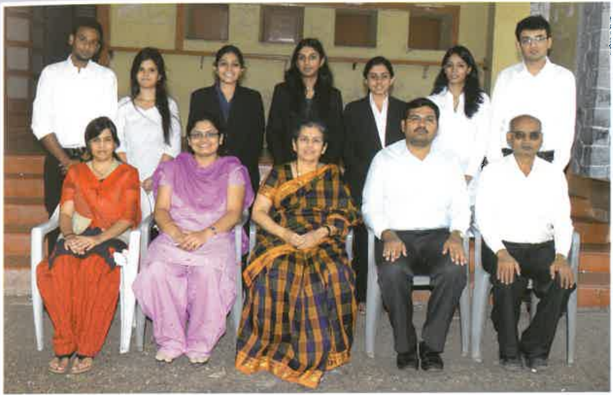
Faculty and Participants of Research Paper, Legal Essay and Case Comment Competitions