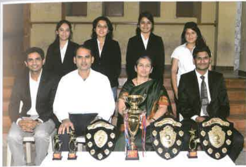
Table Tennis, Badminton and Carrom (Girls)