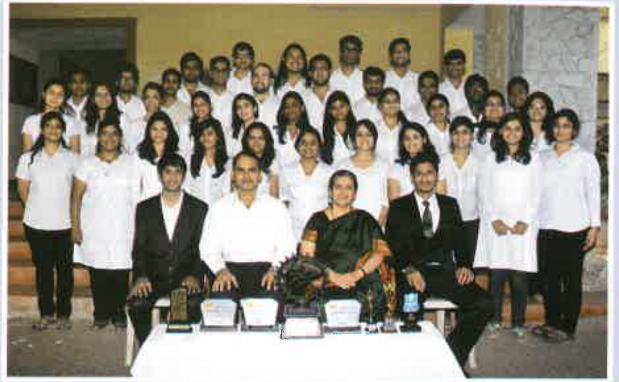
Students and Faculty