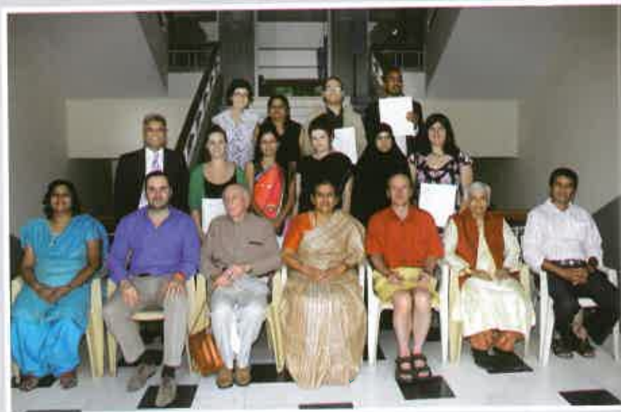
Graduating Candidates of 5 th Batch of International Diploma in Mental Health Law and Human Rights (2012-2013)