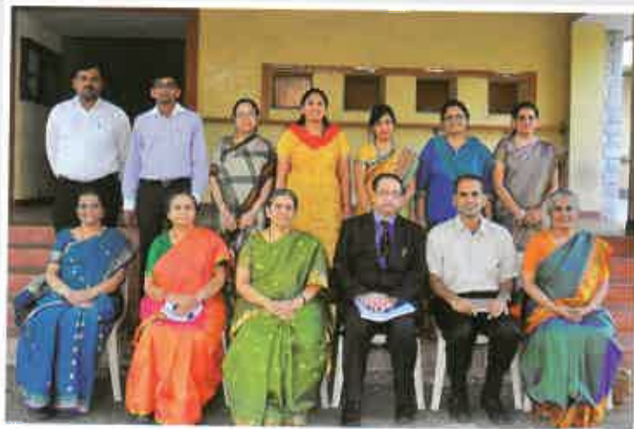
Shri Mohan Parasaran, Solicitor General of India, alongwith Faculty members