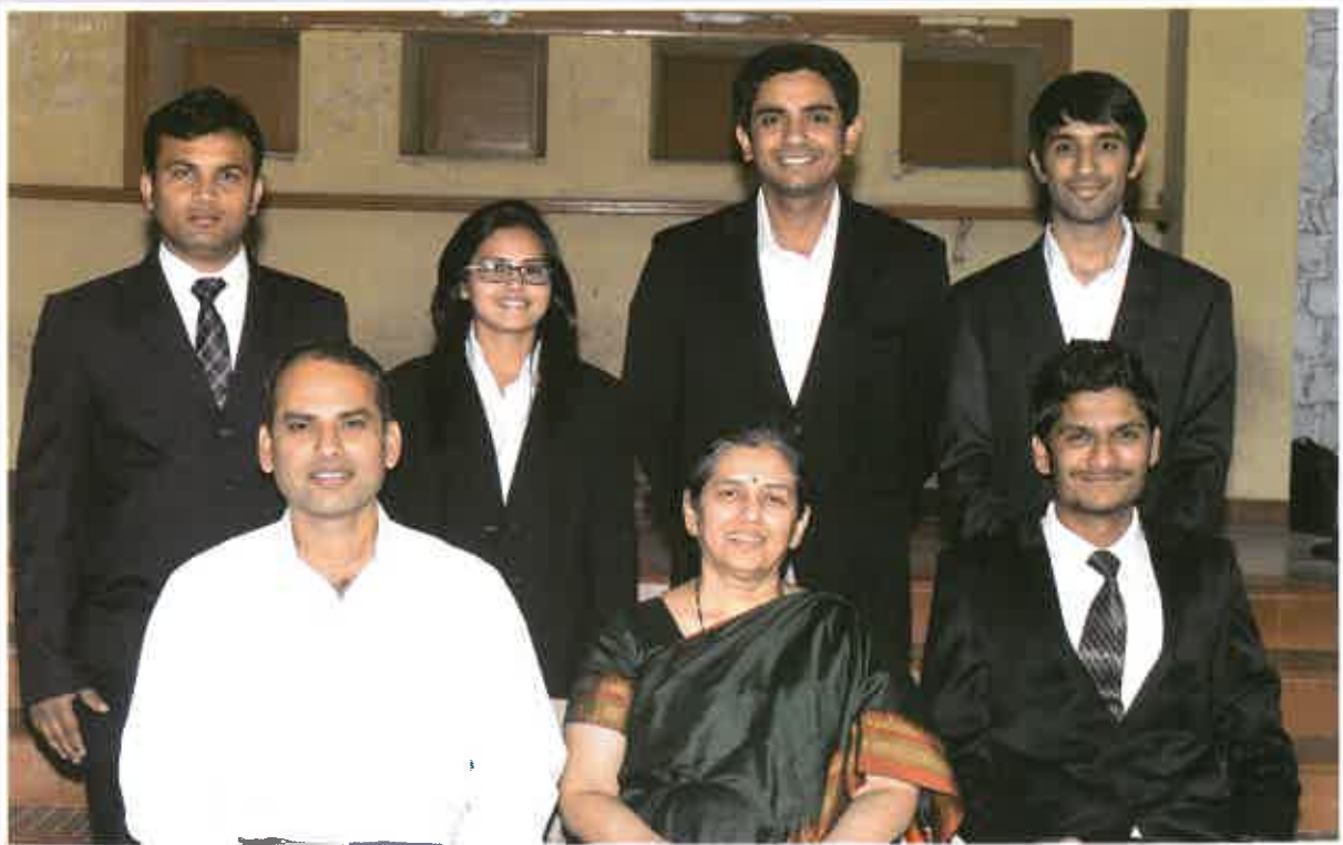
Faculty and Students