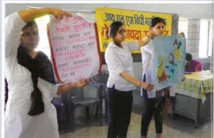
Participation of Student at Legal Aid Camp in Deepgriha Society, Hadapsar Road, Pune on 28 th February 2014