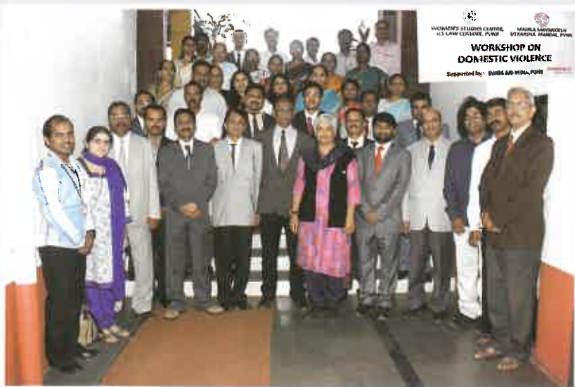
Participants of the Workshop, Ratnagiri