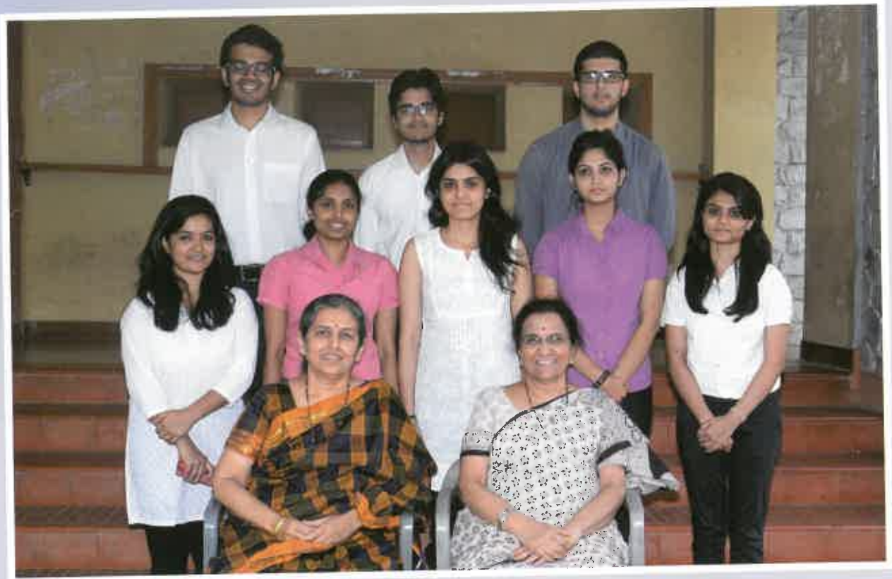
ILS Corporate Law Cell