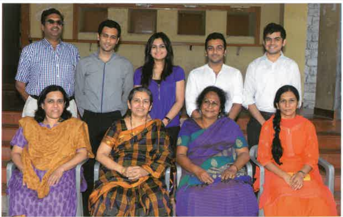
Dignitaries from collaborating institutes with faculty of ILS