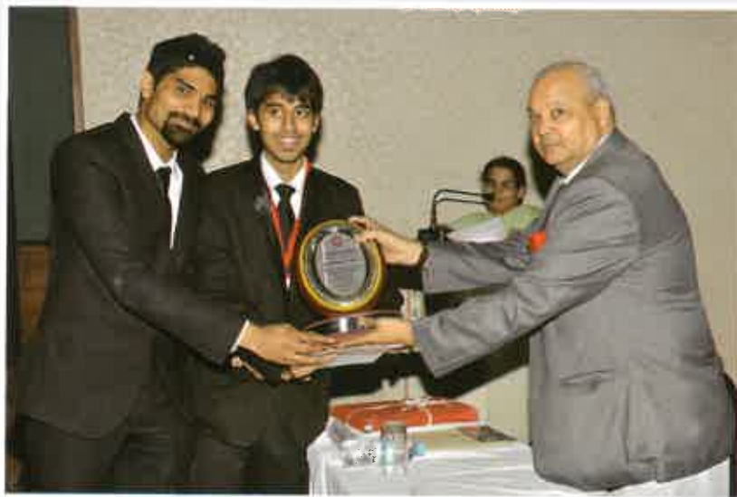
Team from ILS Law College, Pune receiving Justice V. A. Naik Prize for the "Best Team within Maharashtra"