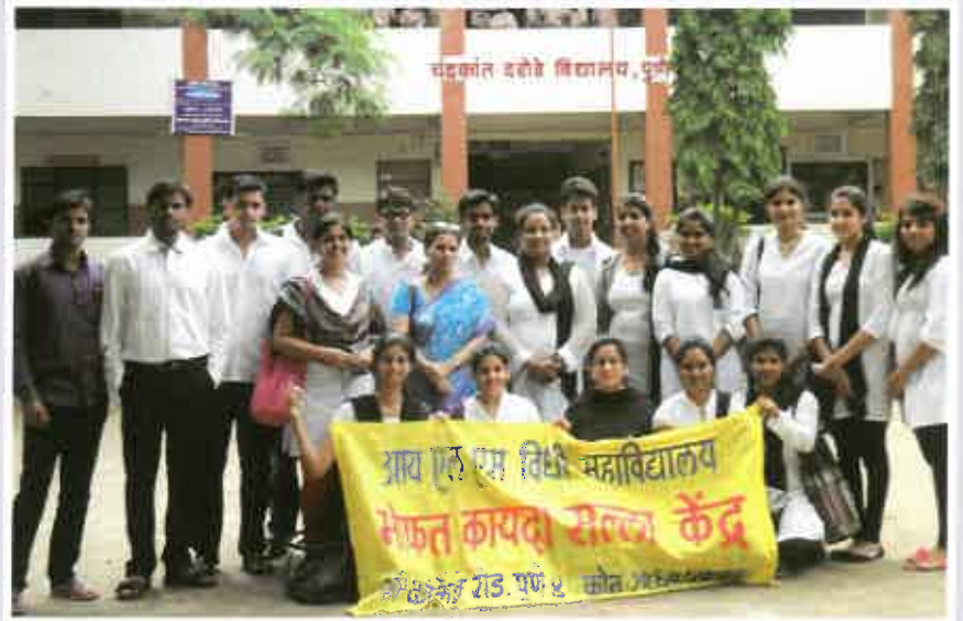
Participation of Students at Legal Literacy Camp, Chandrakant Darode Vidyalaya, BMCC Road, Pune on 16 th August 2013