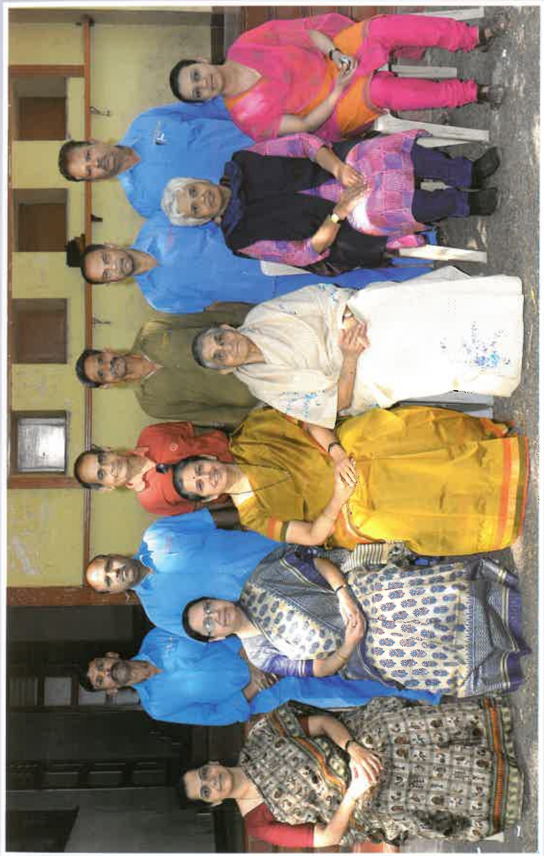
Library Staff with the Chief Guest.