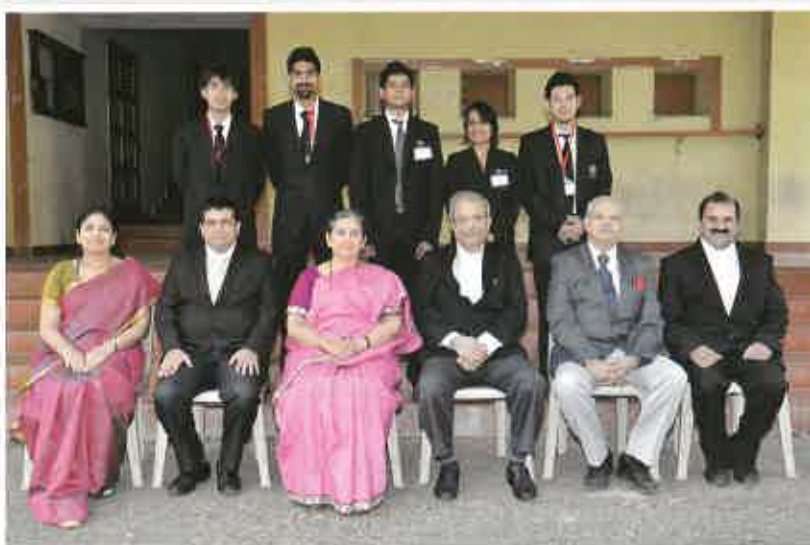
Finalist Teams from School of Christ Law University, Bangalore and ILS Law College Pune with Judges