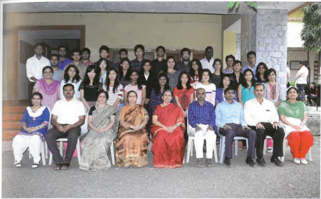
International Students Cell