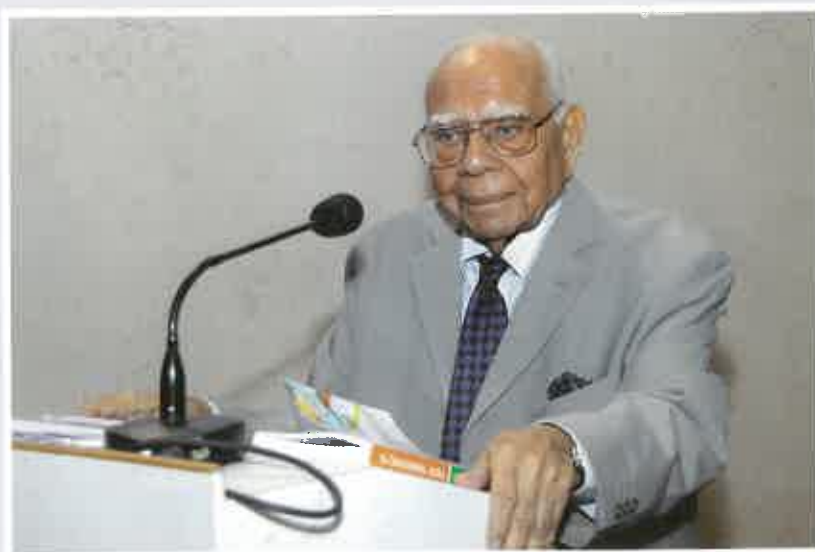
Shri Ram Jethmalani, Senior Advocate, Supreme Court; Member of Parliament at the Seminar