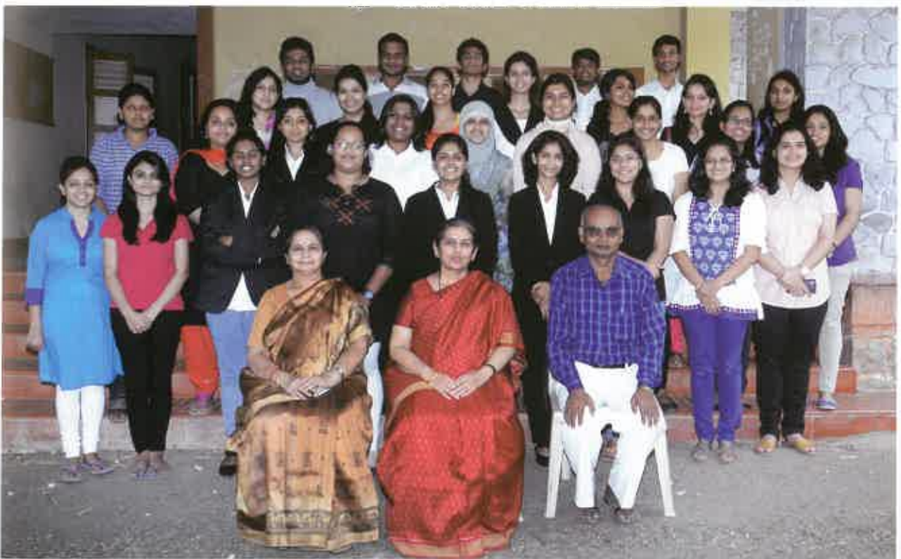
ILS Human Rights Cell