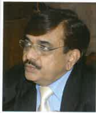
Judge Shri Dilip Deshmukh, Judge in the proceedings