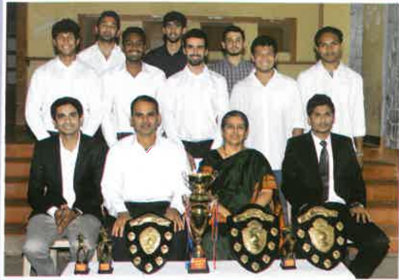
Foot Ball (Boys)