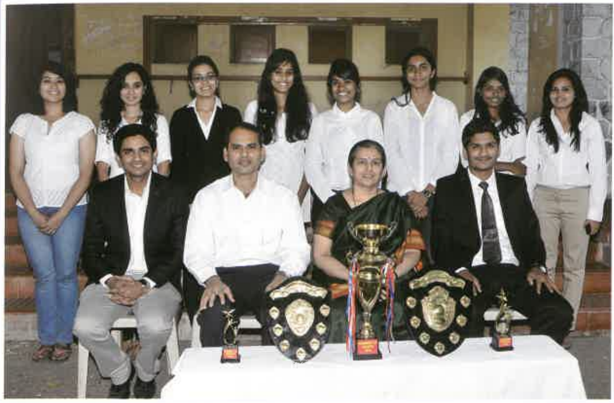
Throw Ball (Girls)