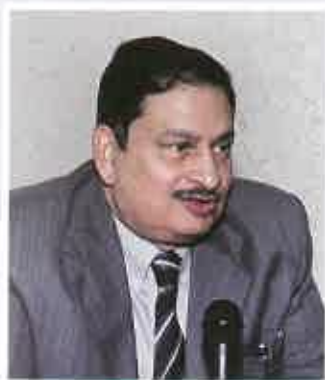
Hon'ble Dilip Karnik, Former Judge, Bombay High Court