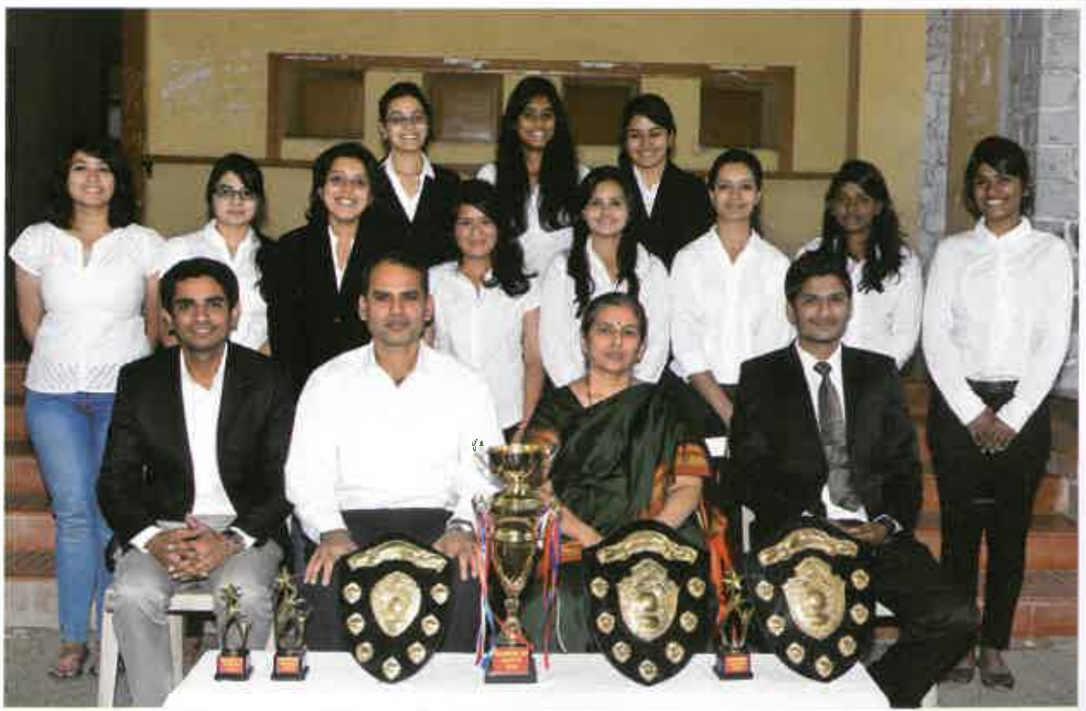
Volley Ball (Girls)