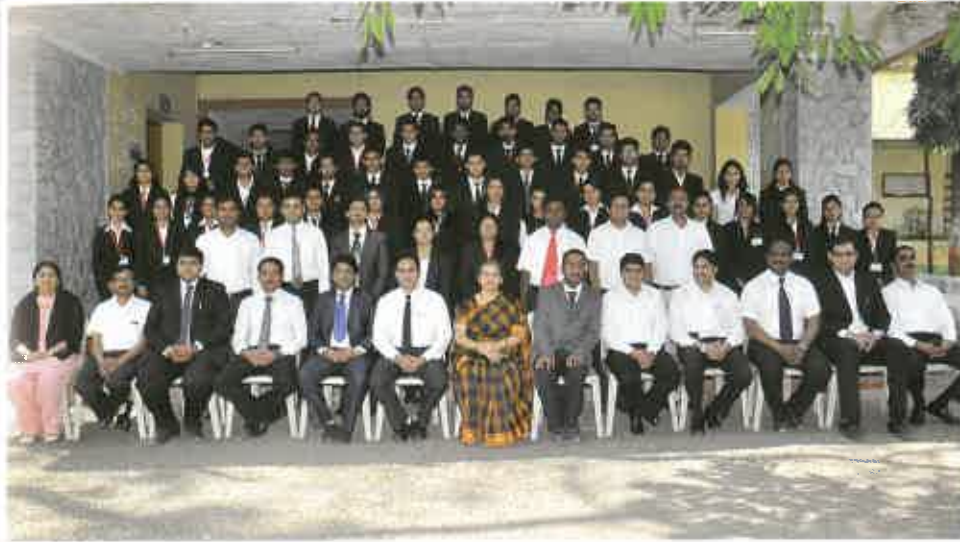
Judges of Preliminary Round with Participants