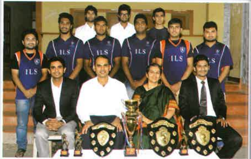
Basket Ball (Boys)