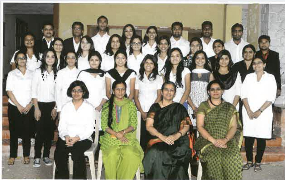
LL.M First Year Students and Faculty