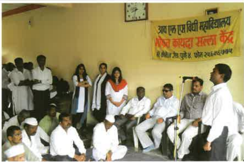
Participation of Students at Legal Literacy Camp, Nanegaon, Maval, Pune on 30 th August 2013