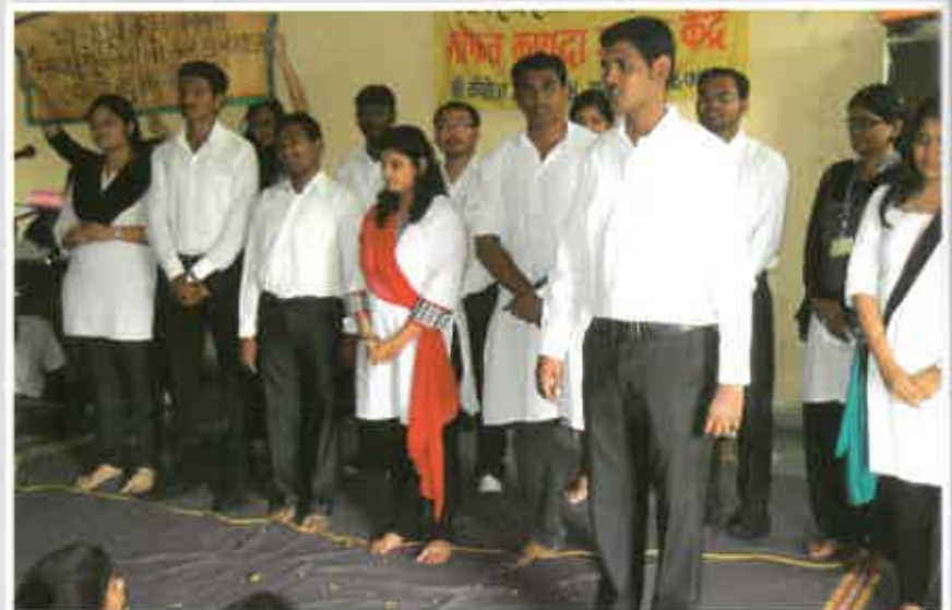
Participation of Students at Legal Literacy Camp, Nanegaon, Maval, Pune on 30 th August 2013