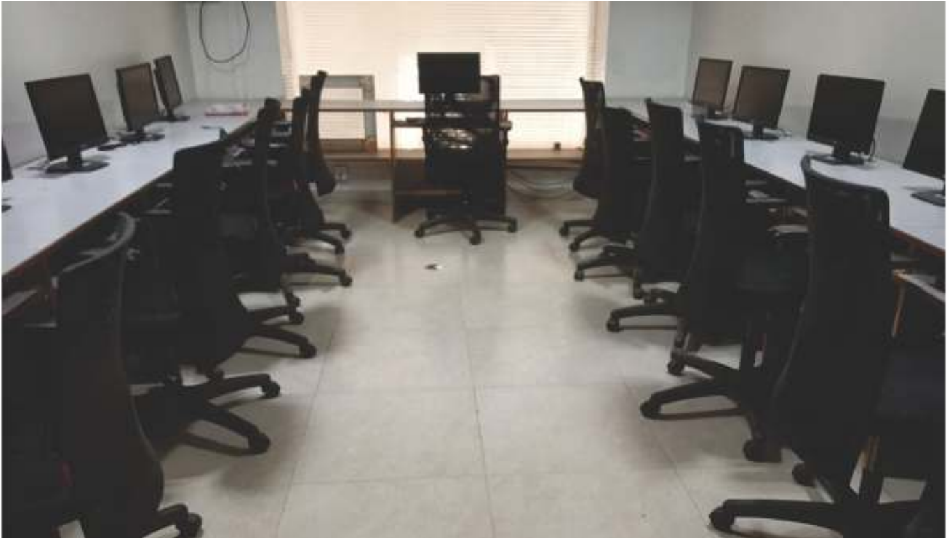
ILS Law College Digital Library