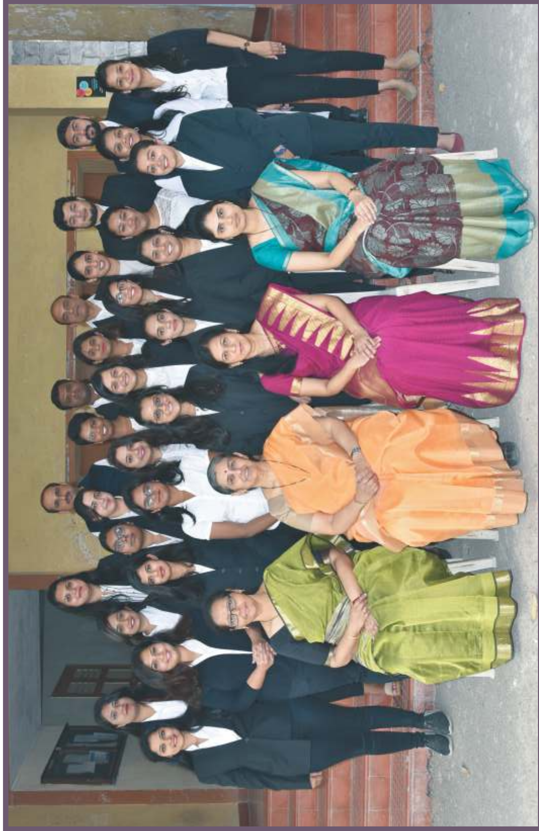
Master in Laws - LL.M. (2017-19)