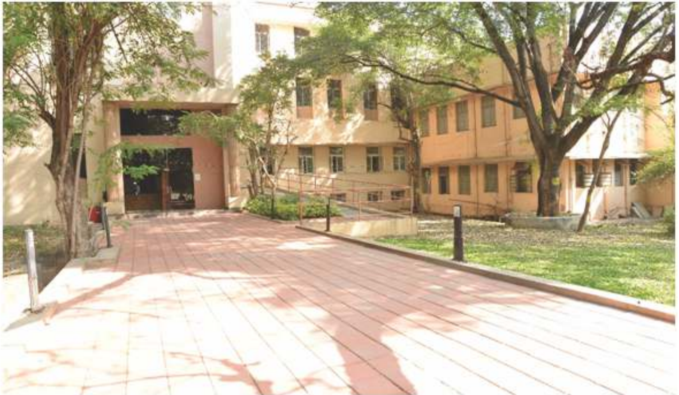
ILS Law College Digital Library