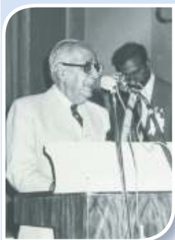
Justice Hidayatulla Inaugurating Bal Memorial Lecture Series