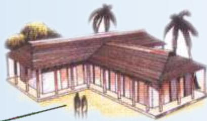
Mess & Recreation Building