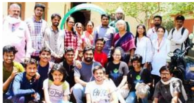
Student Volunteers along with Ms Medhatai Patkar and other members of Narmada Bachao Andolan during Internship with Narmada Bachao Andolan, 13 th to 25 th May 2019