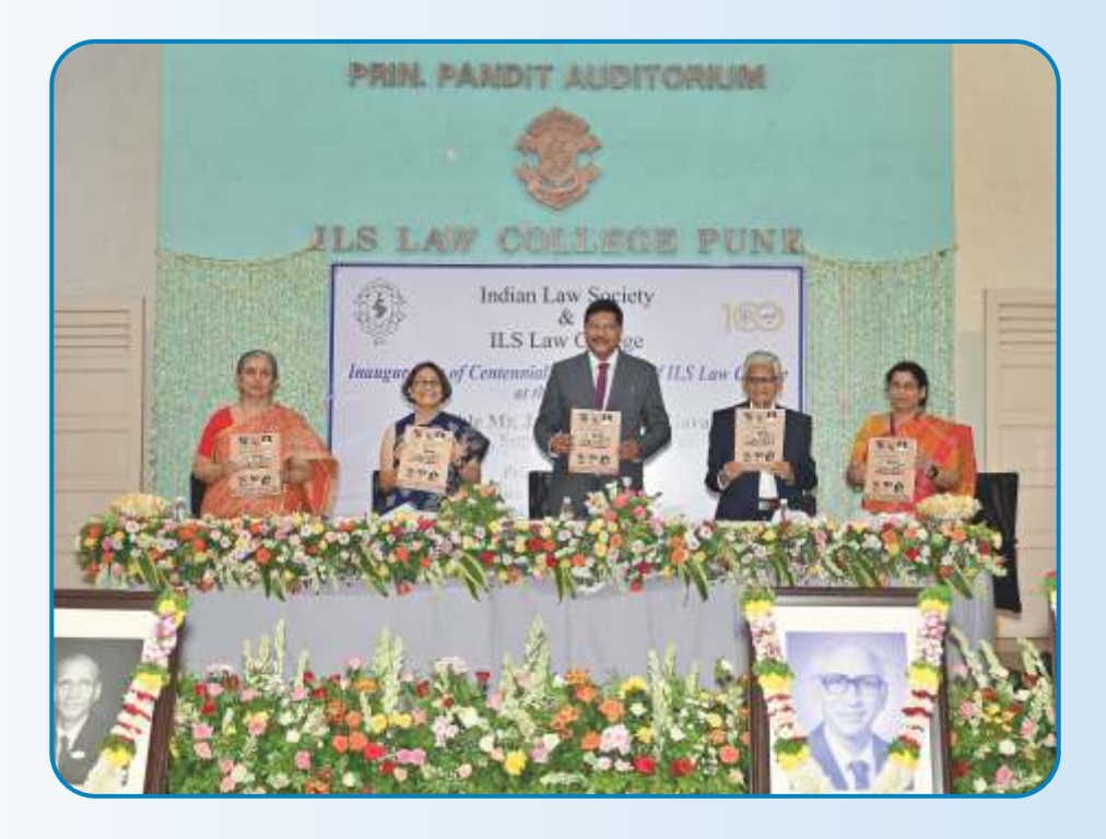
Inaugural and release function of Centenary Celebrations