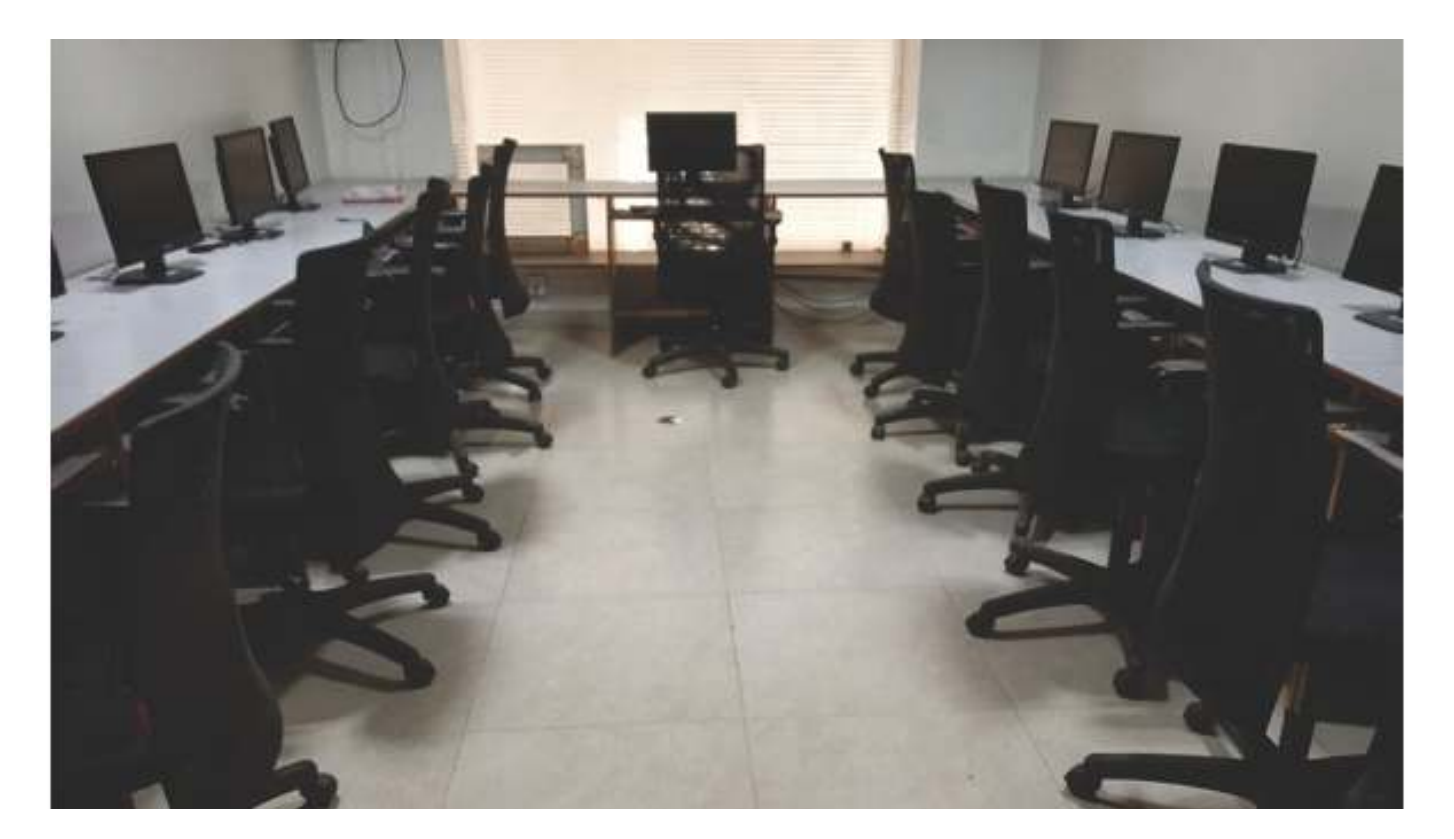
ILS Law College Digital Library